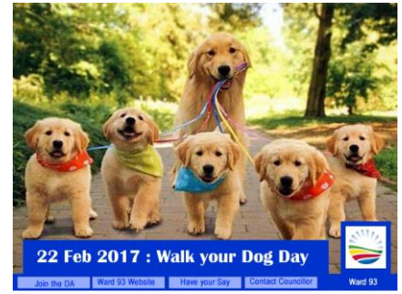
Walk your Dog Day: 22 Feb 2017

Pick n Pay Chili Lane have come on board and offered lunches for those that will be helping clean the river frontage. We are hoping for the community and council to join forces.