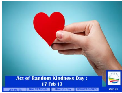
Act of Random Kindness: 17 Feb 2017