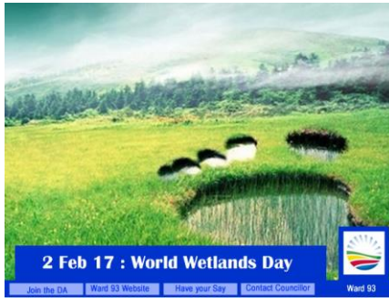
World Wetlands Day: 2 Feb 2017